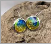
Laura Haszard JEWELLER Transparent glass over precious metals creating unique designs.