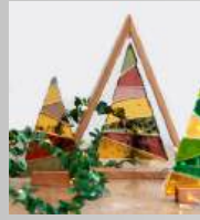
Gisela Spallek GLASS WORKER Contemporary glass objects inspired by colour and light.