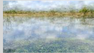
David Radcliffe PHOTOGRAPHER Abstract and representative photography of landscape, bushscape and seascape.