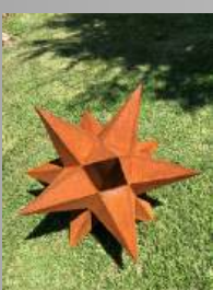
Dave Hayes SCULPTOR Steel landscape sculptures inspired by botanical and contemporary forms.