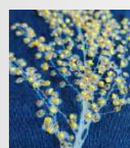
Lisa Shepherd PRINTER Creating delicate representations of Australian Flora.