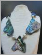
Brigitte Ehrat JEWELLER French inspired hand-crafted jewellery including hand-made paper beads.