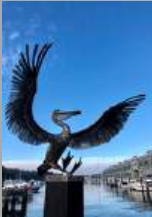
Ulric Steiner SCULPTOR Stainless steel and glass sculpture for gardens and interiors.